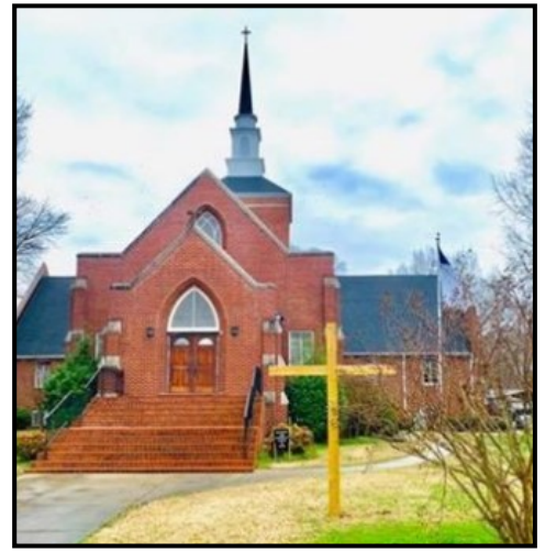
80 North Johnson Street Alamo, TN 38001